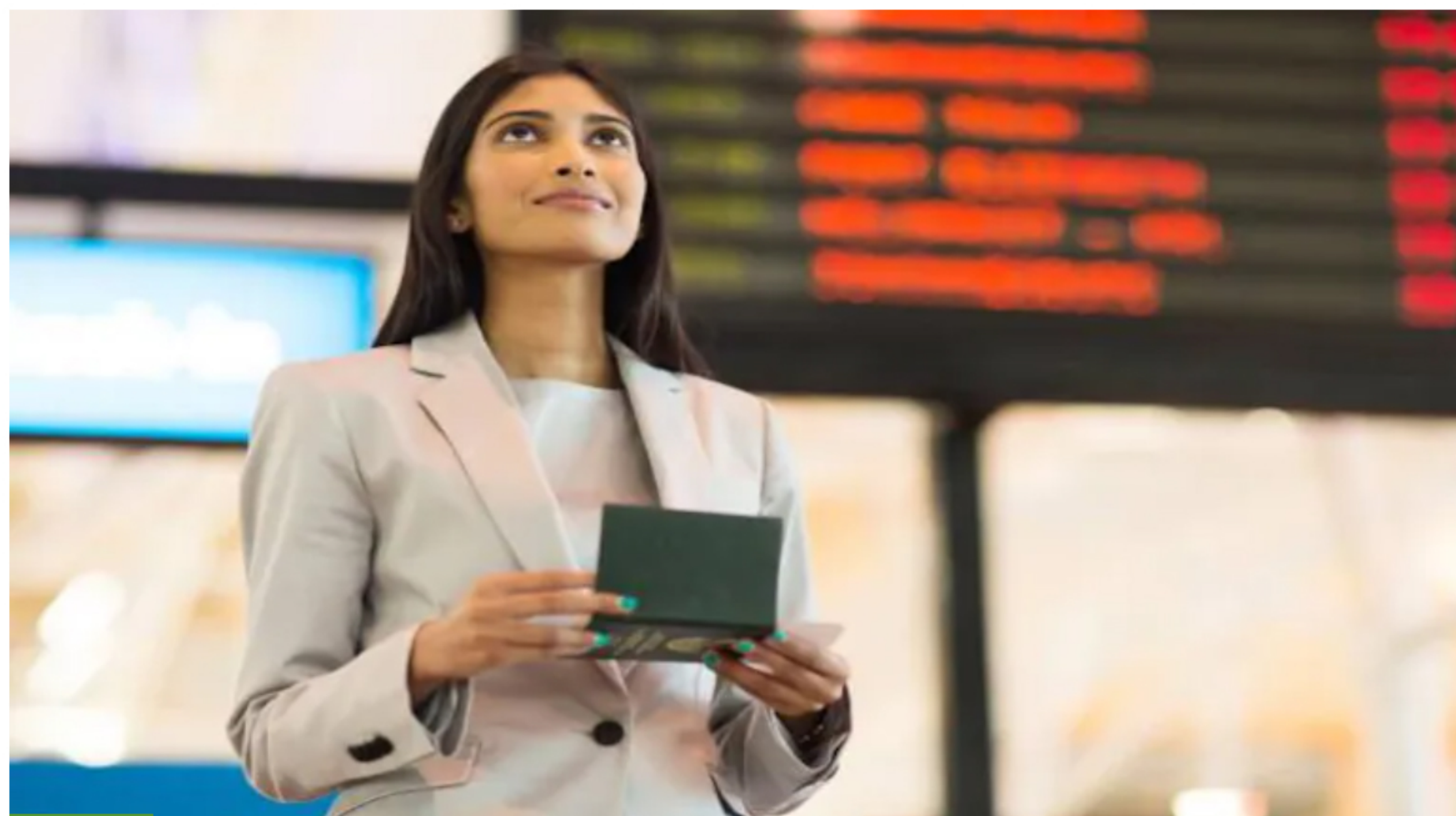
Indian passport allows visa-free travel to 84 countries.

PARESH KARIA | AUGUST 24, 2021 / 09:34 AM IST